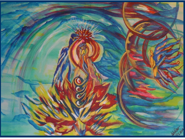
Ego/Soul Dialogue in the place of transition.